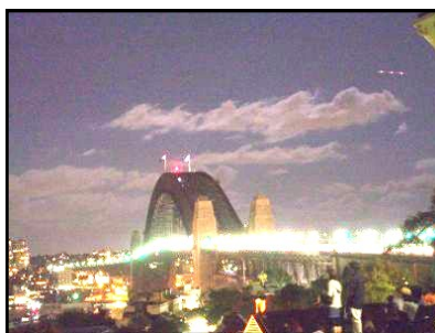
How good does the Harbour Bridge look like this?

This Earth Hour, consider going beyond the hour so that, after you switch the lights back on, you can think about what else you can do to make a difference? Together our individual actions add up.