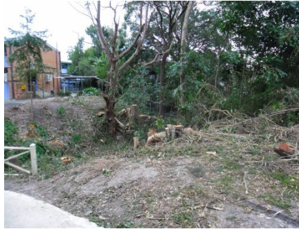
"Habitat modification" at Maclean High School